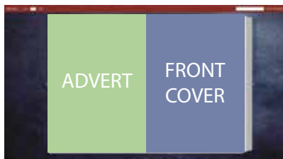
option 3 + inner cover